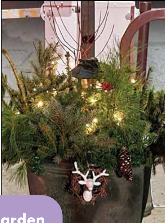
CLCA Garden Committee